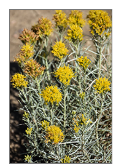
Baby Blue Rabbitbrush flowers

This shrub will require occasional maintenance and upkeep, and is best pruned in late winter once the threat of extreme cold has passed. It is a good choice for attracting bees and butterflies to your yard, but is not particularly attractive to deer who tend to leave it alone in favor of tastier treats. It has no significant negative characteristics.