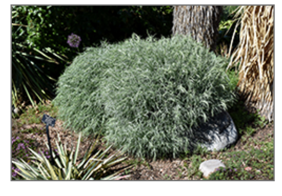
Baby Blue Rabbitbrush

This rugged shrub features grassy, silvery-blue leaves on a compact, mounded habit, which is notably denser than the species; pungent golden-yellow flowers in late summer to early fall; tough and drought tolerant