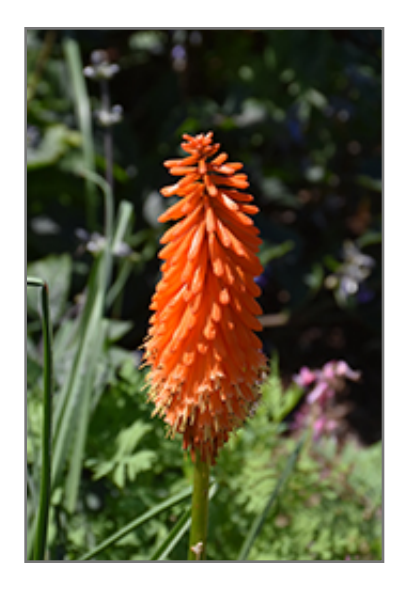
Poker Face Torchlily flowers