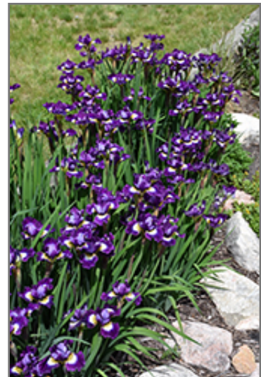
Jewelled Crown Siberian Iris in bloom