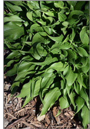
Tongue Twister Hosta foliage