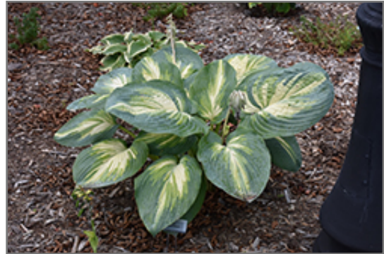
Sound Of Music Hosta