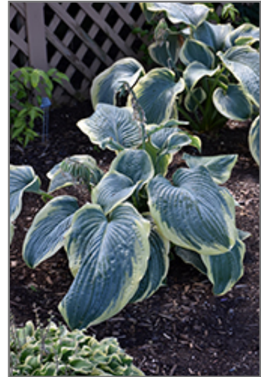
Gigantosaurus Hosta