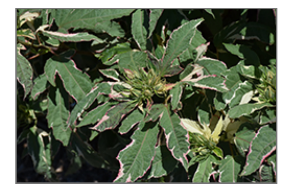
Summer Carnival Hibiscus foliage

Summer Carnival Hibiscus is recommended for the following landscape applications;