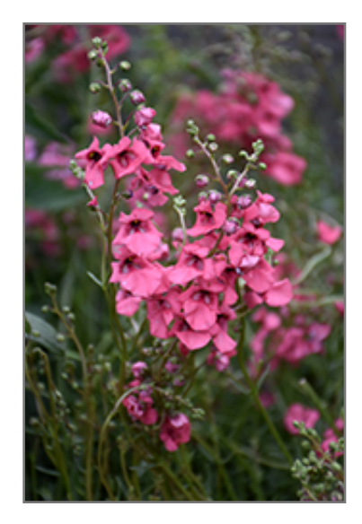
Coral Canyon Twinspur flowers