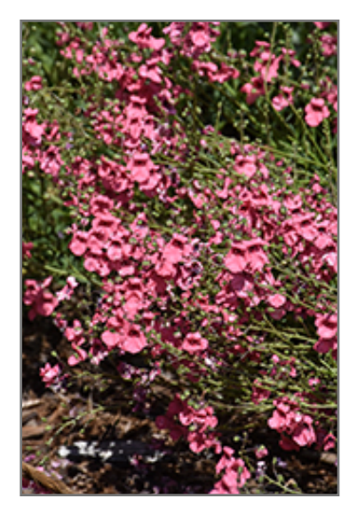
Coral Canyon Twinspur flowers

Coral Canyon Twinspur is recommended for the following landscape applications;