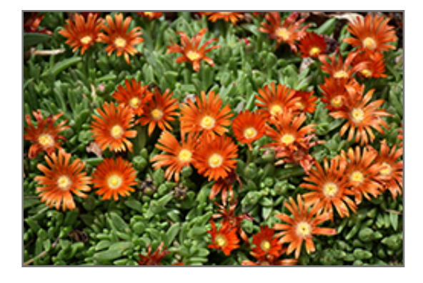
Granita Orange Ice Plant flowers