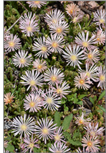
Alan's Apricot Ice Plant flowers

Alan's Apricot Ice Plant is recommended for the following landscape applications;