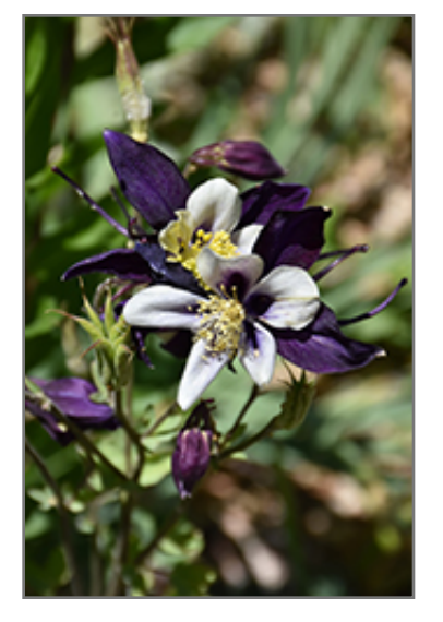
Remembrance Columbine flowers

Rich, shining, violet-blue and white flowers on graceful stems, excellent for attracting wildlife; relatively carefree, and an important addition to any woodland or shade garden; name honors the memory of students and teacher lost at Columbine High School