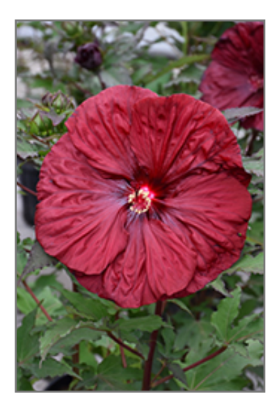
Blackberry Merlot Hibiscus flowers