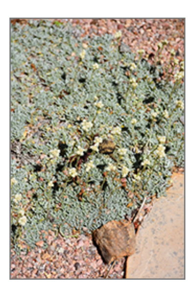
Small-Leaf Pussytoes flowers