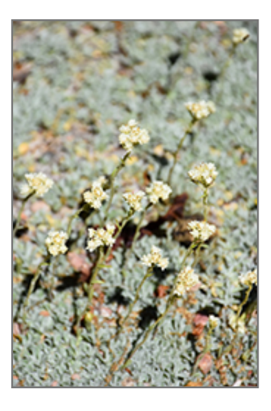
Small-Leaf Pussytoes flowers

Small-Leaf Pussytoes is recommended for the following landscape applications;