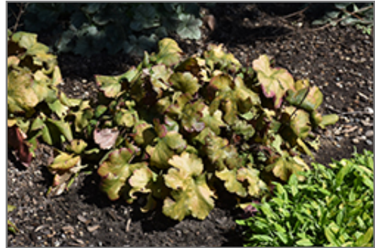
Dolce Toffee Tart Coral Bells

Dolce Toffee Tart Coral Bells is recommended for the following landscape applications;