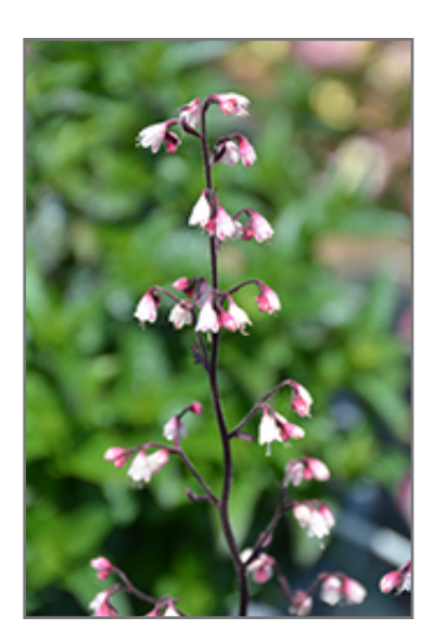
Dolce Frosted Berry Coral Bells flowers

Dolce Frosted Berry Coral Bells is a fine choice for the garden, but it is also a good selection for planting in outdoor pots and containers. With its upright habit of growth, it is best suited for use as a 'thriller' in the 'spiller-thriller' container combination; plant it near the center of the pot, surrounded by smaller plants and those that spill over the edges. Note that when growing plants in outdoor containers and baskets, they may require more frequent waterings than they would in the yard or garden. Be aware that in our climate, most plants cannot be expected to survive the winter if left in containers outdoors, and this plant is no exception. Contact our experts for more information on how to protect it over the winter months.