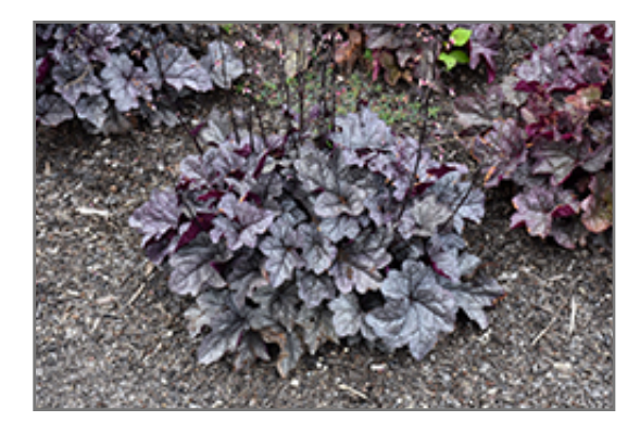
Dolce Frosted Berry Coral Bells