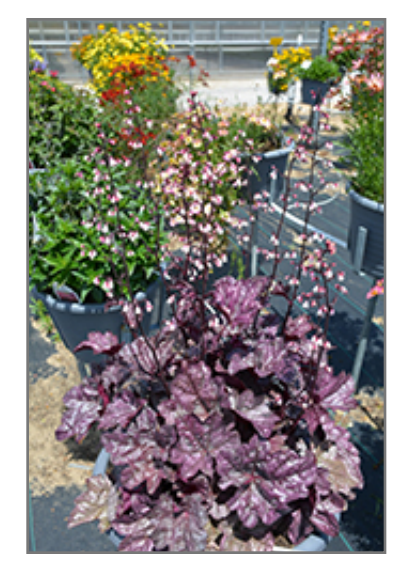
Dolce Frosted Berry Coral Bells in bloom

Dolce Frosted Berry Coral Bells is a dense herbaceous evergreen perennial with tall flower stalks held atop a low mound of foliage. Its relatively fine texture sets it apart from other garden plants with less refined foliage.