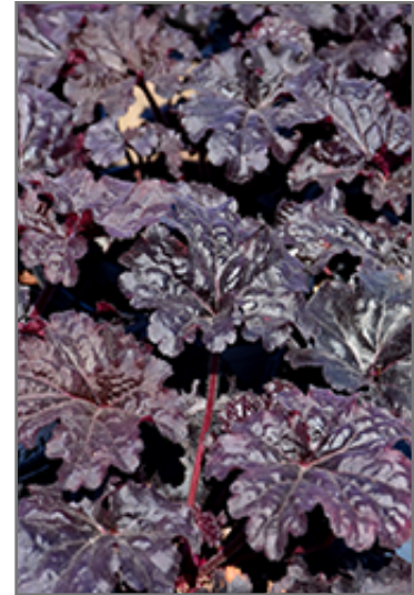
Dressed Up Evening Gown Coral Bells foliage

Dressed Up Evening Gown Coral Bells is recommended for the following landscape applications;