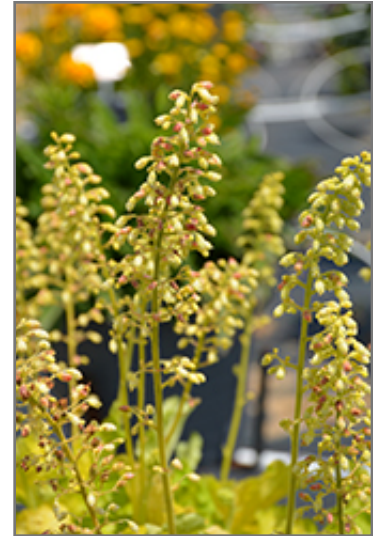
Dressed Up Ball Gown Coral Bells flowers

Dressed Up Ball Gown Coral Bells is a fine choice for the garden, but it is also a good selection for planting in outdoor pots and containers. It is often used as a 'filler' in the 'spiller-thriller-filler' container combination, providing a mass of flowers and foliage against which the thriller plants stand out. Note that when growing plants in outdoor containers and baskets, they may require more frequent waterings than they would in the yard or garden. Be aware that in our climate, most plants cannot be expected to survive the winter if left in containers outdoors, and this plant is no exception. Contact our experts for more information on how to protect it over the winter months.