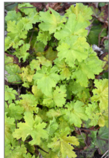
Dressed Up Ball Gown Coral Bells