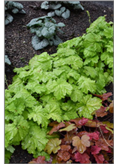
Dressed Up Ball Gown Coral Bells

Dressed Up Ball Gown Coral Bells is recommended for the following landscape applications;