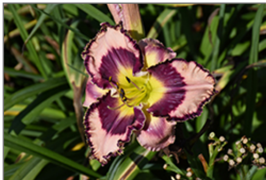
Rainbow Rhythm Sound of My Heart Daylily flowers