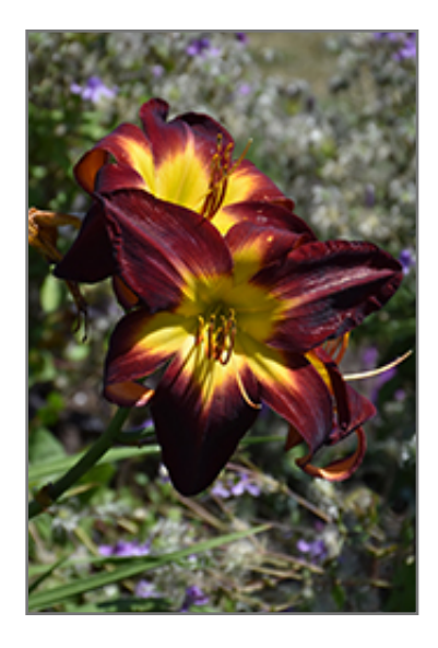
Persian Ruby Daylily flowers