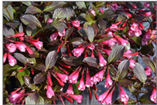
Very Fine Wine Weigela flowers

Very Fine Wine Weigela is recommended for the following landscape applications;