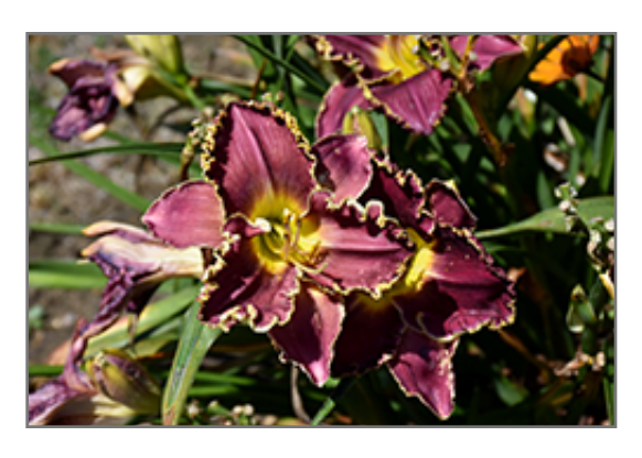
Cosmic Struggle Daylily flowers

A beautiful midseason bloomer featuring intense wine purple flowers with a neat lemon-yellow picotee edge, rising above mounds of arching green foliage; a prolific rebloomer with great color fade resistance; easy to grow, great for beds and borders