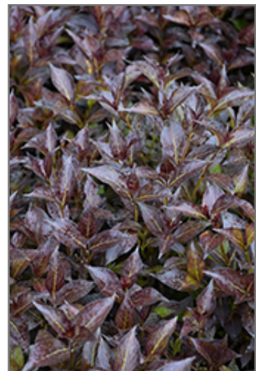
Midnight Wine Shine Weigela foliage