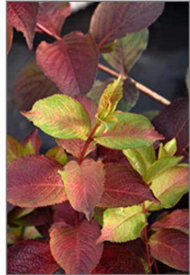
Midnight Sun Reblooming Weigela foliage