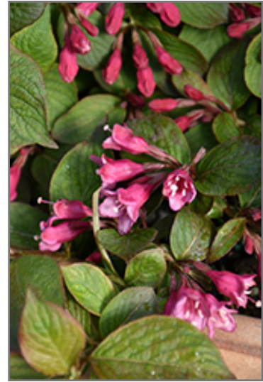
Midnight Sun Reblooming Weigela flowers

Midnight Sun Reblooming Weigela makes a fine choice for the outdoor landscape, but it is also well-suited for use in outdoor pots and containers. It is often used as a 'filler' in the 'spiller-thriller-filler' container combination, providing a mass of flowers and foliage against which the thriller plants stand out. Note that when grown in a container, it may not perform exactly as indicated on the tag - this is to be expected. Also note that when growing plants in outdoor containers and baskets, they may require more frequent waterings than they would in the yard or garden. Be aware that in our climate, most plants cannot be expected to survive the winter if left in containers outdoors, and this plant is no exception. Contact our experts for more information on how to protect it over the winter months.