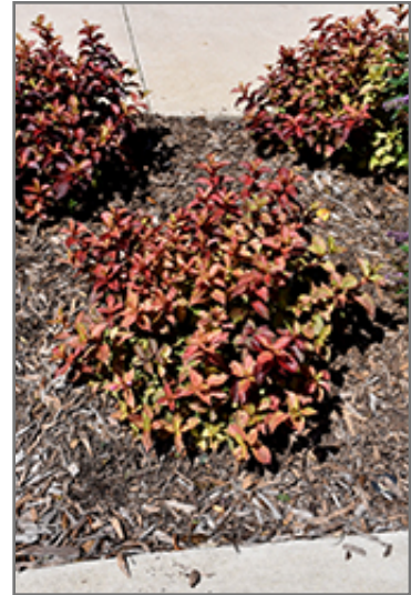
Midnight Sun Reblooming Weigela