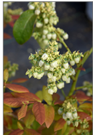
Sky Dew Gold Ornamental Blueberry flowers