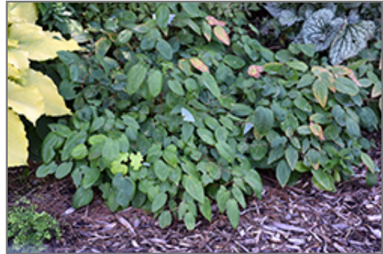
Rigoletto Barrenwort

Rigoletto Barrenwort is recommended for the following landscape applications;