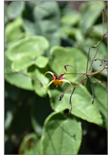
Court Jester Barrenwort flowers

Court Jester Barrenwort is recommended for the following landscape applications;