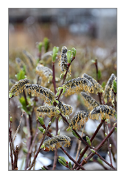
Black Cat Pussywillow foliage