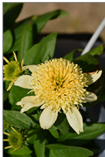
Double Coded Butter Pecan Coneflower flowers