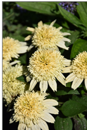
Double Coded Butter Pecan Coneflower flowers

Double Coded Butter Pecan Coneflower is recommended for the following landscape applications;