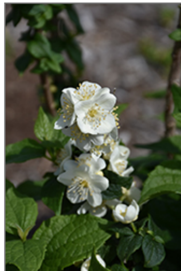
Illuminati Tower Mockorange flowers