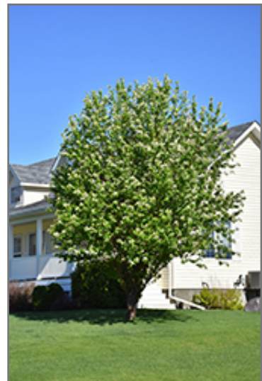
Amur Cherry