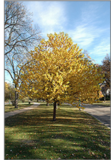
Amur Cherry in fall

This tree should only be grown in full sunlight. It does best in average to evenly moist conditions, but will not tolerate standing water. It is not particular as to soil type or pH. It is somewhat tolerant of urban pollution. This species is not originally from North America.