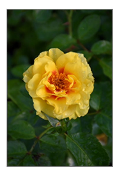
Rise Up Ringo Rose flowers