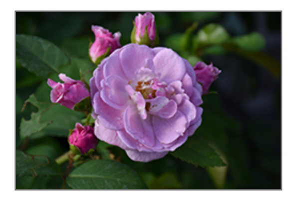
Rise Up Lilac Days Rose flowers