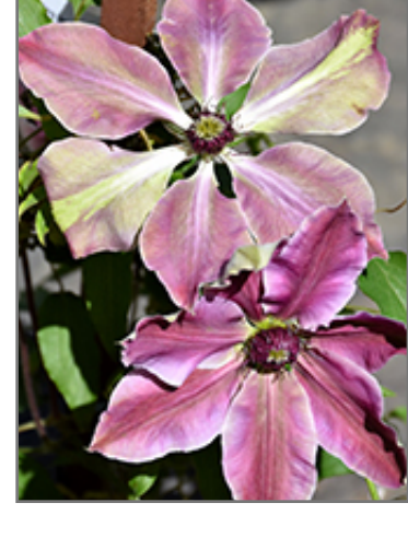
Lincoln Star Clematis flowers

Lincoln Star Clematis features bold cherry red star-shaped flowers with white eyes and pink edges at the ends of the branches from early to late summer. It has green deciduous foliage. The compound leaves do not develop any appreciable fall colour.