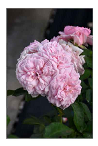
Reminiscent Pink Rose flowers