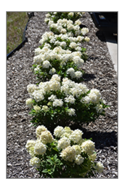
Tiny Quick Fire Hydrangea in bloom