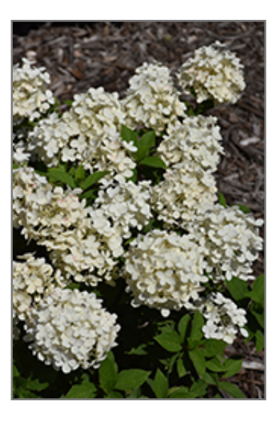
Tiny Quick Fire Hydrangea flowers