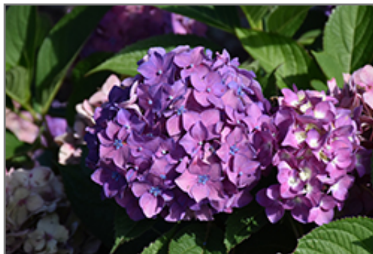
Let's Dance Arriba! Hydrangea flowers

Let's Dance Arriba! Hydrangea is recommended for the following landscape applications;