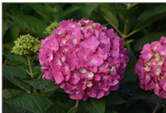
Let's Dance Arriba! Hydrangea flowers