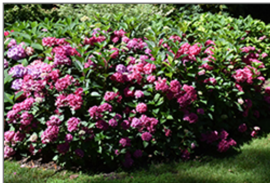
Let's Dance Arriba! Hydrangea in bloom

Let's Dance Arriba! Hydrangea makes a fine choice for the outdoor landscape, but it is also well-suited for use in outdoor pots and containers. Because of its height, it is often used as a 'thriller' in the 'spiller-thriller-filler' container combination; plant it near the center of the pot, surrounded by smaller plants and those that spill over the edges. It is even sizeable enough that it can be grown alone in a suitable container. Note that when grown in a container, it may not perform exactly as indicated on the tag - this is to be expected. Also note that when growing plants in outdoor containers and baskets, they may require more frequent waterings than they would in the yard or garden. Be aware that in our climate, most plants cannot be expected to survive the winter if left in containers outdoors, and this plant is no exception. Contact our experts for more information on how to protect it over the winter months.