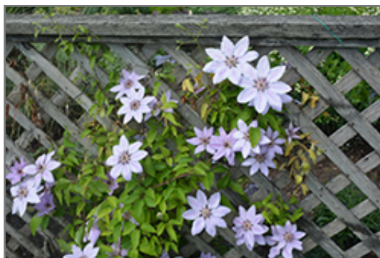
Fireworks Clematis in bloom