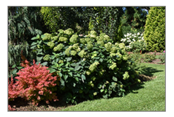
Invincibelle Sublime Smooth Hydrangea in bloom

Invincibelle Sublime Smooth Hydrangea is recommended for the following landscape applications;