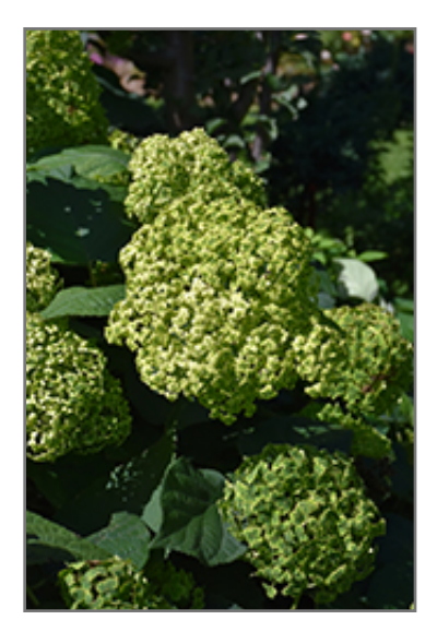
Invincibelle Sublime Smooth Hydrangea flowers

This shrub will require occasional maintenance and upkeep, and is best pruned in late winter once the threat of extreme cold has passed. It is a good choice for attracting bees and butterflies to your yard. It has no significant negative characteristics.