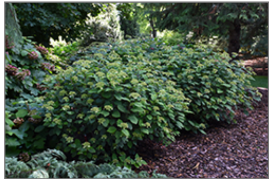
Invincibelle Lace Hydrangea in bloom