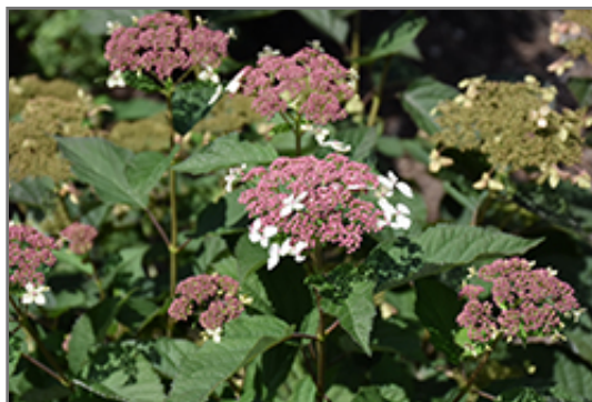
Invincibelle Lace Hydrangea flowers