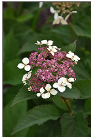
Invincibelle Lace Hydrangea flowers

Invincibelle Lace Hydrangea is a multi-stemmed deciduous shrub with a more or less rounded form. Its relatively coarse texture can be used to stand it apart from other landscape plants with finer foliage.