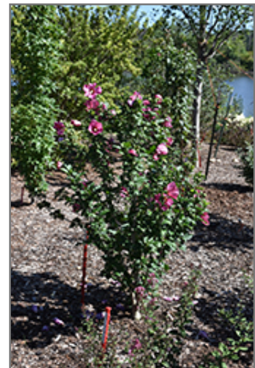
Paraplu Rouge Rose of Sharon in bloom