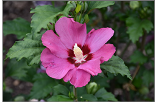
Paraplu Rouge Rose of Sharon flowers

Paraplu Rouge Rose of Sharon is a multi-stemmed deciduous shrub with an upright spreading habit of growth. Its average texture blends into the landscape, but can be balanced by one or two finer or coarser trees or shrubs for an effective composition.