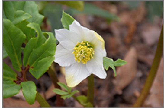
Single White Hellebore flowers