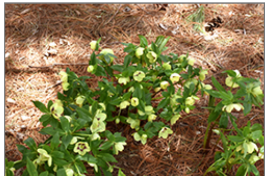
Honeymoon Spanish Flare Hellebore in bloom