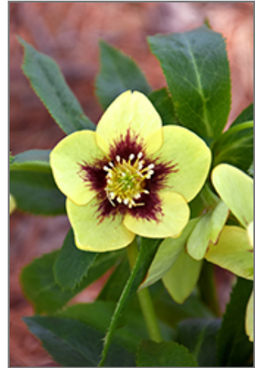
Honeymoon Spanish Flare Hellebore flowers

Honeymoon Spanish Flare Hellebore is recommended for the following landscape applications;