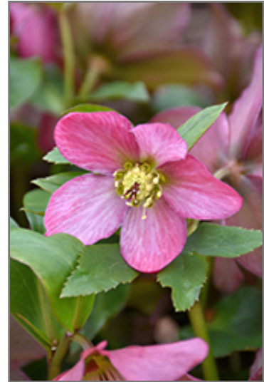
Rosemary Hellebore flowers