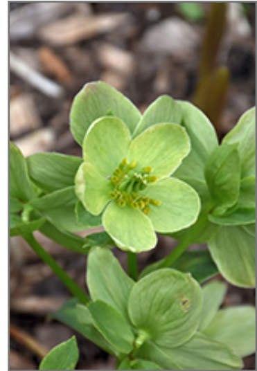
Valentine Green Hellebore flowers

A wonderful shorter variety blooming from late winter through mid spring; creamy white, cup-shaped flowers maturing to light green are borne atop dark green, leathery foliage; a great addition to containers, borders and beds; prefers partial to full shade