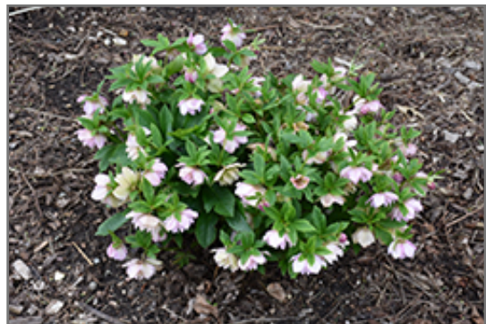
Wedding Party Flower Girl Hellebore in bloom