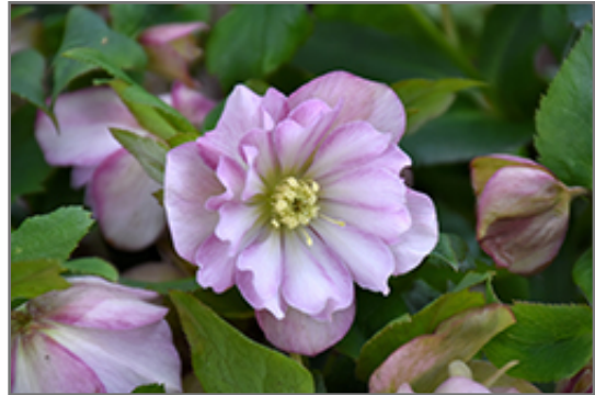
Wedding Party Flower Girl Hellebore flowers

Wedding Party Flower Girl Hellebore is recommended for the following landscape applications;