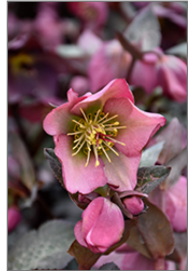
Frostkiss Dorothy's Dawn Hellebore flowers

Frostkiss Dorothy's Dawn Hellebore is recommended for the following landscape applications;