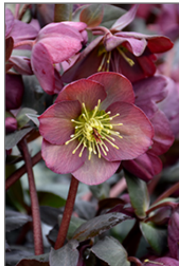
Frostkiss Dana's Dulcet Hellebore flowers

Frostkiss Dana's Dulcet Hellebore is recommended for the following landscape applications;