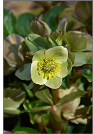
HGC Cinnamon Snow Hellebore flowers

HGC Cinnamon Snow Hellebore is recommended for the following landscape applications;