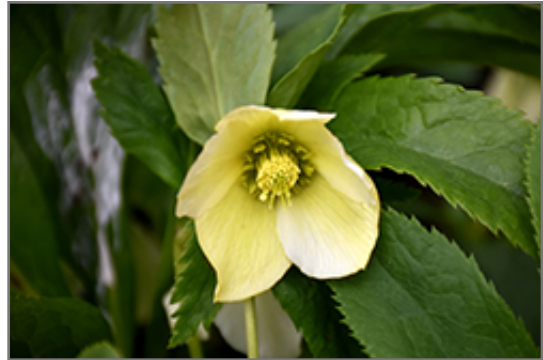
Honeymoon California Dreaming Hellebore flowers