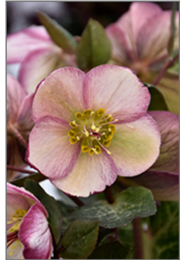
Frostkiss Bayli's Blush Hellebore flowers

Frostkiss Bayli's Blush Hellebore is recommended for the following landscape applications;